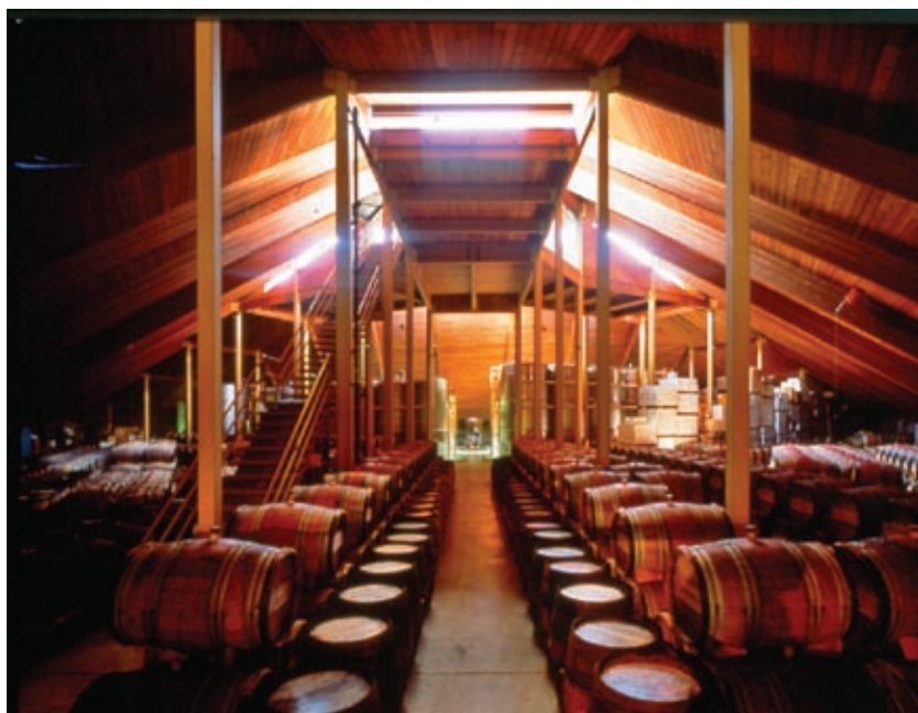
Chappellet Winery vineyards (top left) and cellar (above).