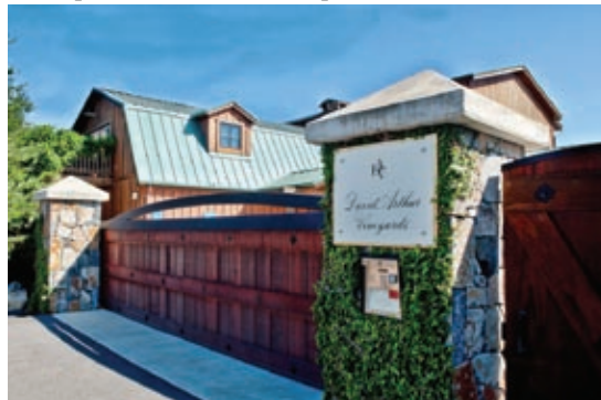
Winery at David Arthur Vineyards.