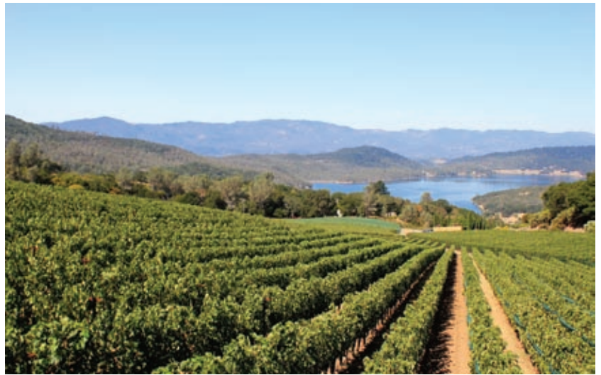
Plantings at Bryant Family Vineyard.