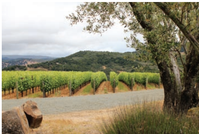
Colgin Cellars' IX Estate vineyard.